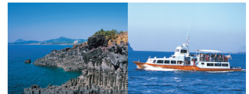
▶Pillar-shaped Joint & Cruise