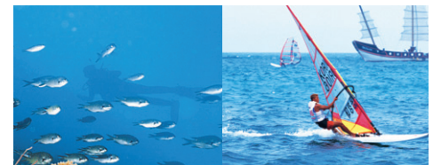
▶Scuba Diving & Wind Surfing