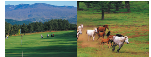
▶Golf Rounding & Riding